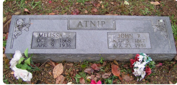
George W. Twidwell Cemetery, Wayne County, Missouri, USA